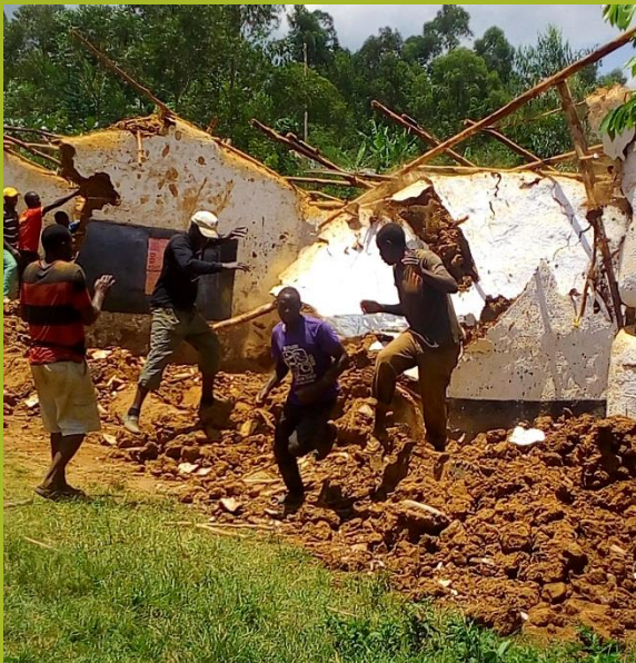
Demolition of our mudroom classes