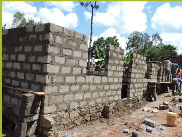
Construction of new classes in progress