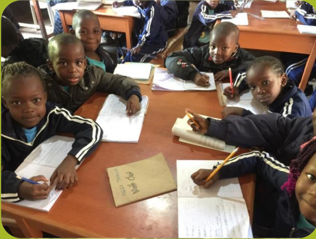
Grade 1 students of Kakamega School using their new furniture

As we came to the end of 2019, I started preparing to walk our three Overcoming Faith Schools into the year 2020. I had the confidence knowing that we had the support of our sponsoring organization Tucklets and their partners. Some of the things that needed focus included;