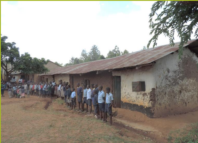
Old mudroom classes at Bunyore school that were demolished by the order from the Government

Massive improvement on infrastructural facilities: