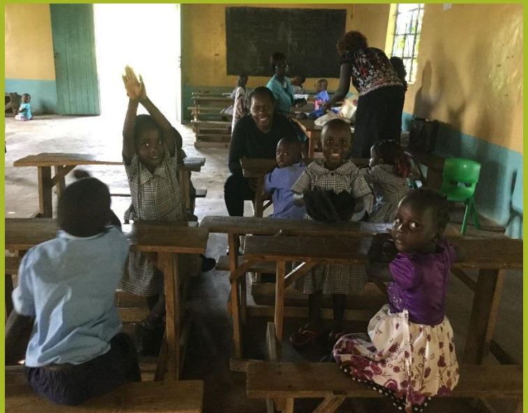
Church turned into classes as construction continues in Bunyore