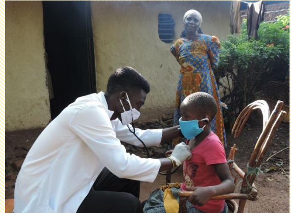
Treating our children our children in villages